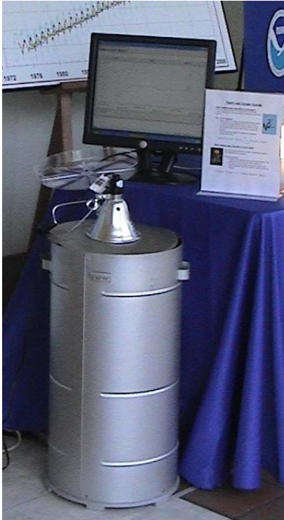
Earth Day 2005 Setup of this Activity