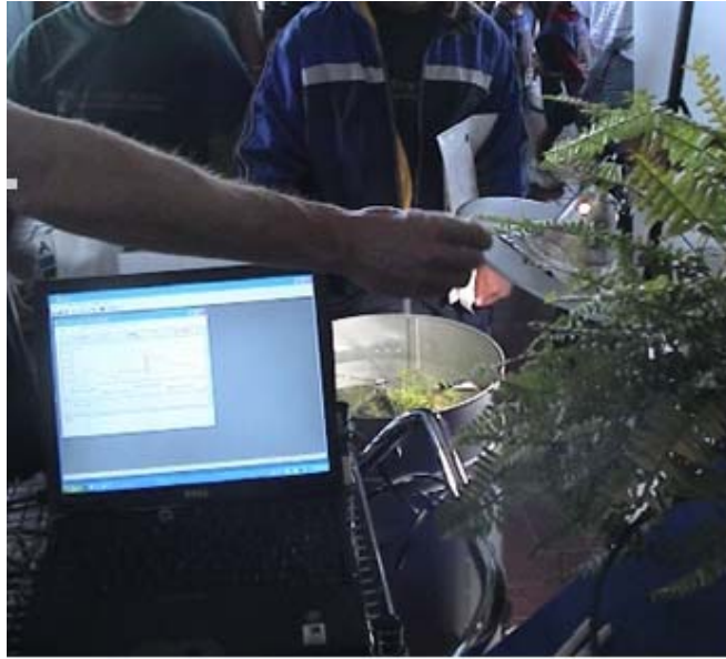
Demonstration setup at Earth Day 2006.