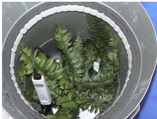
Looking into the plant container, one can see the Carbon Dioxide measurement instrument.